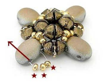
7) Pick up 3 SB15 in the second hole of the Samos