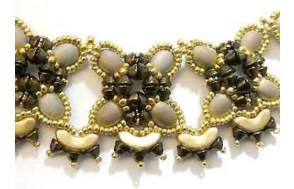
23) Continue the step 22 to the entire row 😊