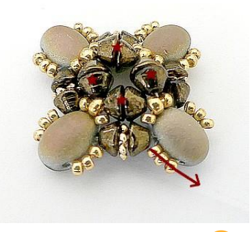
9) Here is the result 😌 Come out HERE after the three SB15