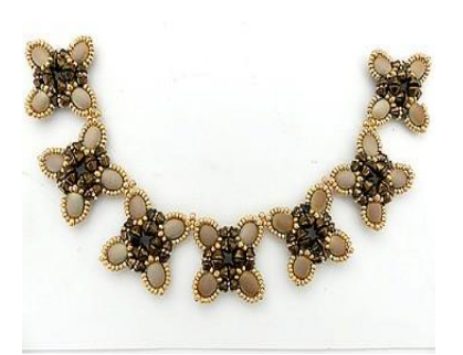
14) Here is the result 😌