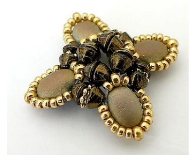
Here is the result Stop the thread. You have finished 1 element