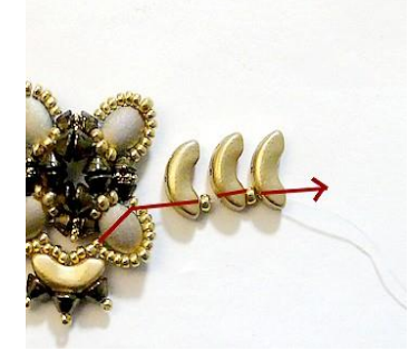
24) Exit to the Samos and insert 28 Arcos