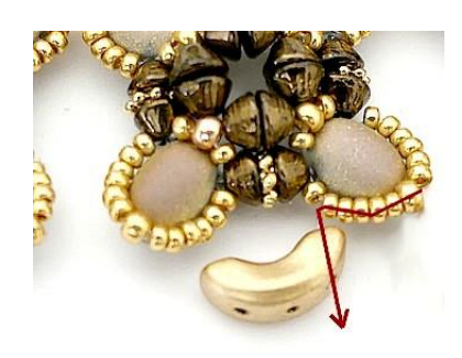
15) Insert a thread in the Samos at the bottom and exit HERE. Insert 1 Arcos