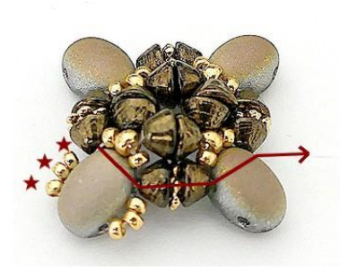
8) Pick up 3 SB15 in the Samos and exit HERE. Repeat steps 7 and 8 for all Samos