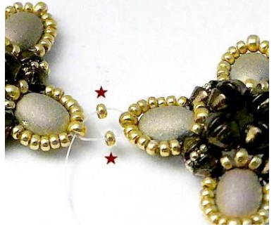
13) Connect all elements. Perform this operation only on the top of the necklace with 2 SB15 inserted into SB11