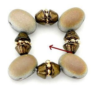
2) Close in circle and consolidate.Come out HERE