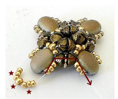
10) Pick up 3 SB15, 1 SB 11, 3 SB15 and exit HERE. Repeat this step for all Samos