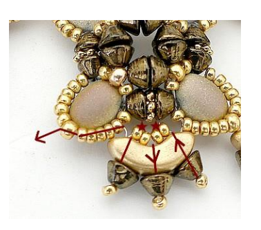
17) Repeat step 16 and exit after SB11 from the next Samos