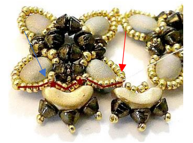
22) Come out HERE (blue arrow). Insert 1 SB15. Enter the following 4 SB 15 over the Arcos. Insert 1 SB15 and exit HERE (red arrow)