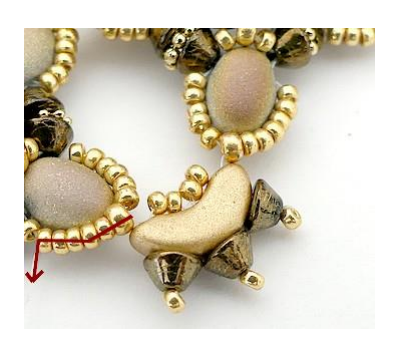
18) Repeat step 16 and17.Come out HERE