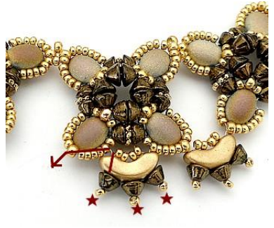
19) Insert 1 Arcos. Repeat step 16 to 18