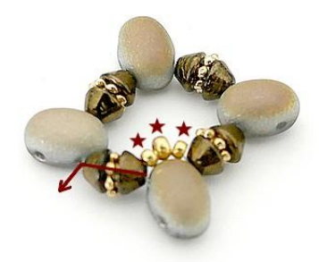
3) Pick up 1 SB15, 1 SB11 and 1 SB15 over the Samos. Do Entire Row Like This