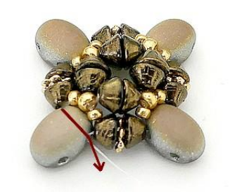
6) Here is the result 😌 Come out HERE